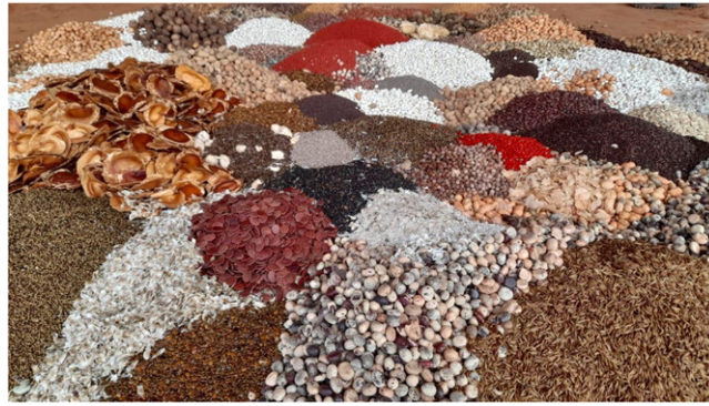
Fig. 4 Muvuca, a set of native tree species and green manure species, being prepared to be mixed and directly seeded on previously prepared soils along the Xingu River Basin. (We thank Marcela Melry Mateus Deluce for kindly providing this image).

of factors since the increment in forest cover by the creation of protected areas or natural regeneration following land abandonment caused by rural-to-urban migrations, hunting regulations and management frameworks, and change in human perception on the benefits of conservation. While active reintroduction programs have been implemented to help wild animals return to their niches, lynxes, wolves, and bears, have naturally recolonized their original areas, even spreading further. To facilitate the monitoring and managing of carnivores, guidelines for populations were established by the European Commission to avoid the difficulties imposed by subnational administrative units.