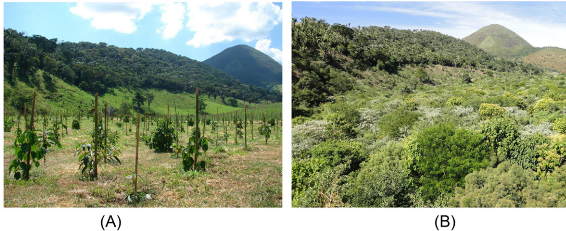
Fig. 2 Newly implanted forest restoration planting (A) and the same area 2 years old (B) in the mountainous region of Teresópolis, Rio de Janeiro, Brazil.

expansion of markets for ecosystem services and goods brings an opportunity for developing nature-based solutions and increasing natural capital conservation and biotechnology uses. Forest restoration promotes increasing habitat coverage for biodiversity, protecting soils, providing hydrological services, and assisting crop pollination. Besides, it offers models that can attend the carbon market. Responsible countries with multifunctional conserved or restored forests must keep track of the ecosystem services market, protecting the sociobiodiversity and valuing forests' productive potential. Forest ecosystem services must pass from invisibility to a valued and marketable natural wealth.