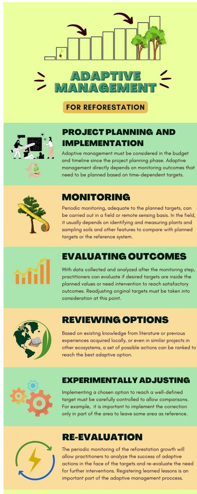
Fig. 3 Framework for the adoption of adaptive management.